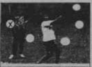
The correct answer is shown above. There were no correct answers received so the prize will be carried forward to a future contest.